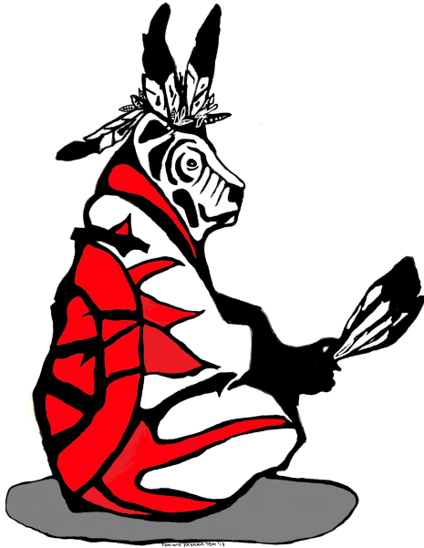
Todd Jamieson YCDSB Knowledge Keeper

Nous sommes rassemblés sur les eaux et les terres ancestrales de tous les peuples autochtones, qui ont laissé leurs traces sur la Terre Mère avant nous.